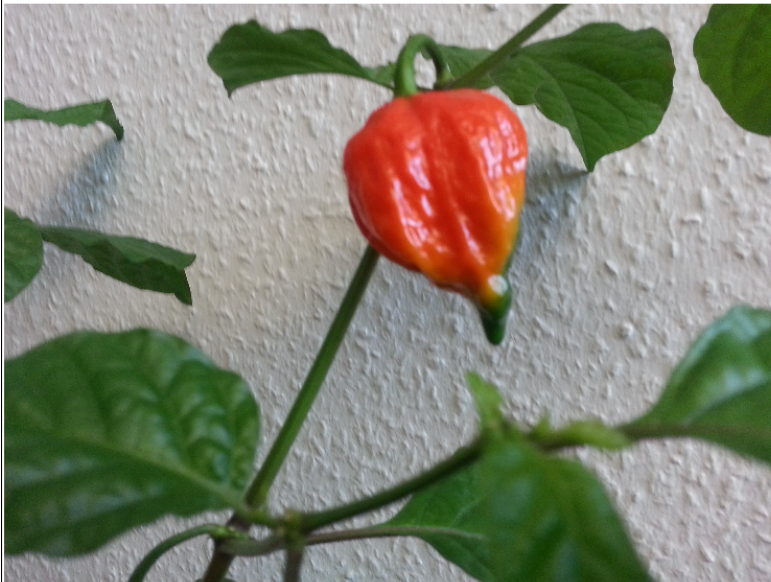
FIGURE 1: THE GOAL: PUBLISHING A RECIPE FOR A CHILI SAUCE IN HTML FORMAT